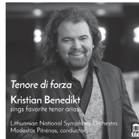
Tenore di forza, DE 3571