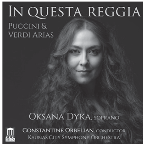
In Questa Reggia DE 3586