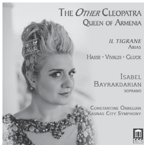
The Other Cleopatra DE 3591