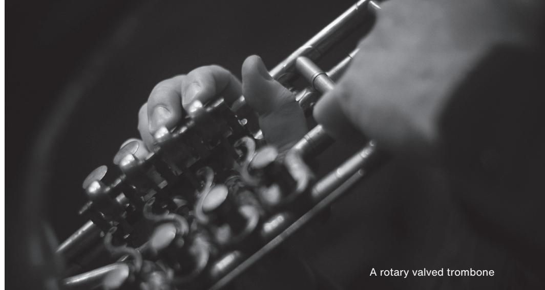
A rotary valved trombone