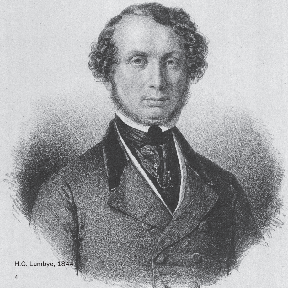
H.C. Lumbye, 1844