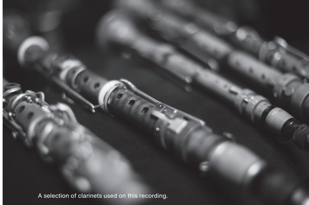
A selection of clarinets used on this recording.