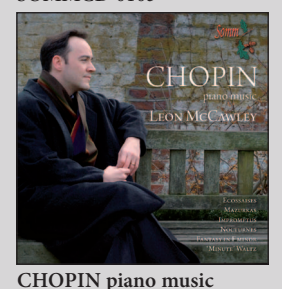
Ecossaises · Mazurkas Impromptus · Nocturnes Fantasy in F minor 'Minute' Waltz