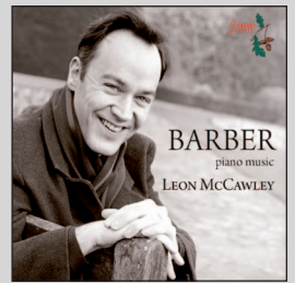
BARBER piano music including Sonata for Piano, op. 26