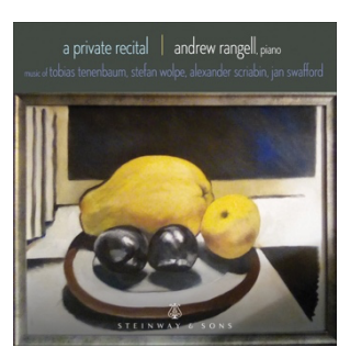
Schubert Recital STNS 30215