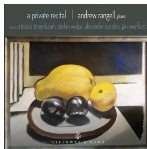
Schubert Recital STNS 30215