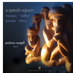
A Spanish Sojourn STNS 30212