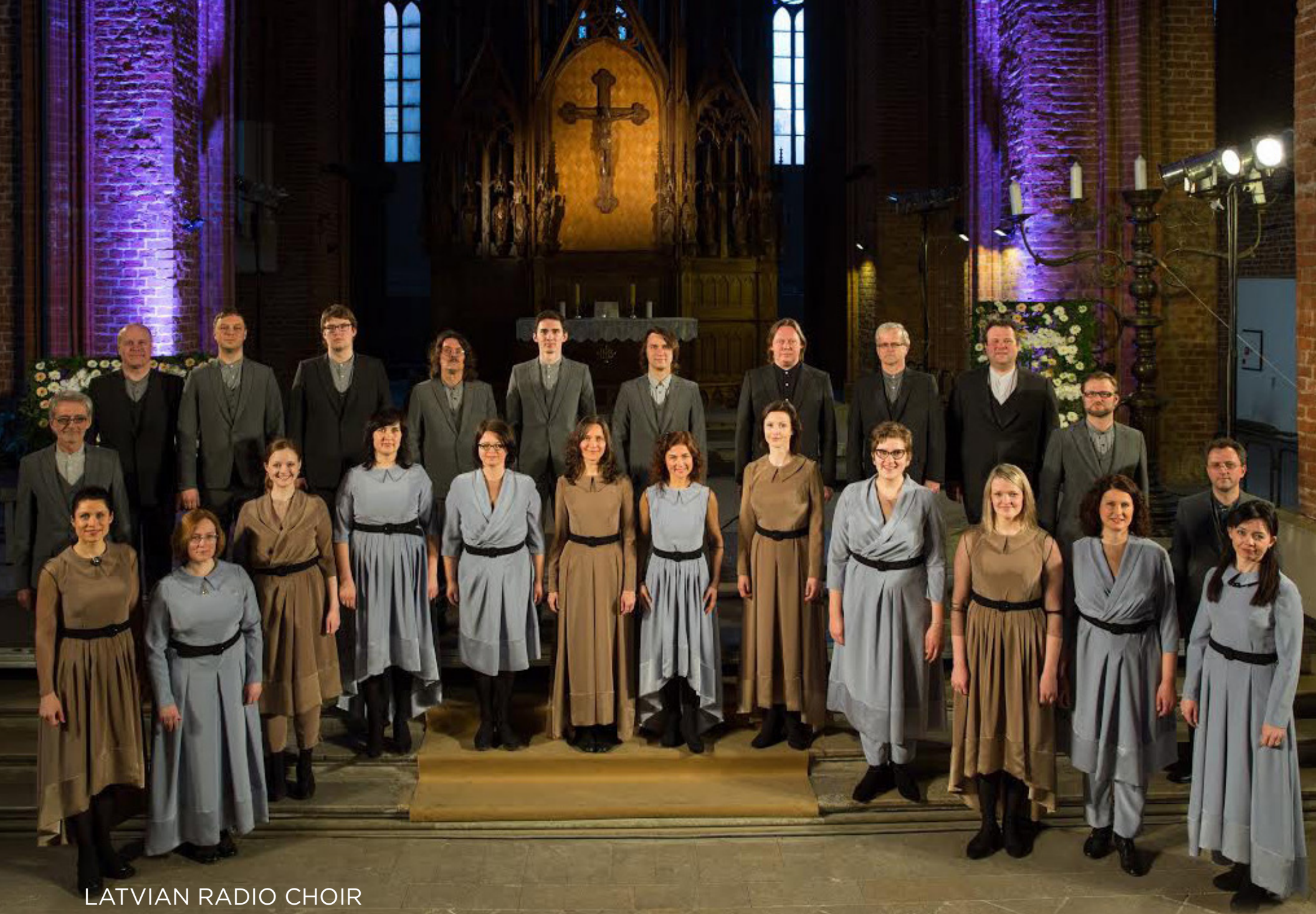
LATVIAN RADIO CHOIR