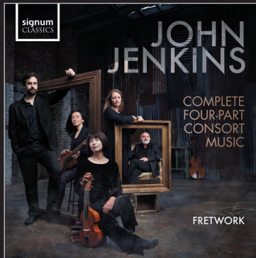
John Jenkins: Complete Four Part Consort Music Fretwork SIGCD528

"Thomas Morley's lovely phrase evoking music's ability to link earthly listeners to heavenly contemplation." The Times