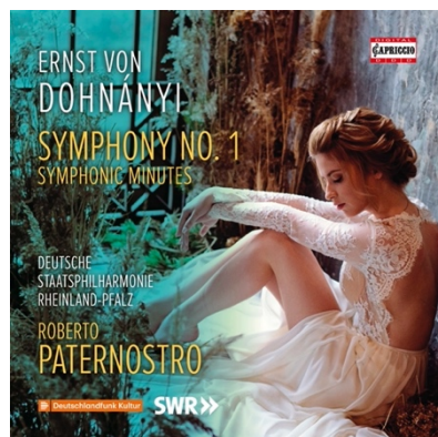
Ernst von Dohnányi Symphony No. 1 1CD · C5386