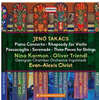
Jenő Takács Piano Concerto · Rhapsody 1CD · C5438