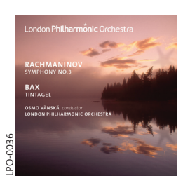
'Vänskä's account of the Third Symphony is a marvel of measured, uninflated eloquence.' The Sunday Times