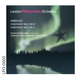
'These performances generate excitement no studio version could capture.' The Guardian

For more information or to purchase CDs, telephone +44 (0)20 7840 4242 or visit Ipo.org.uk/shop