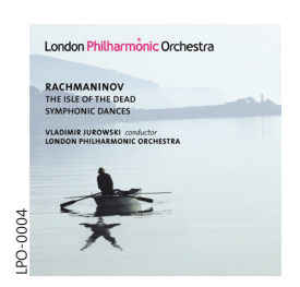
'In these dedicated performances both works cast a powerful spell.' BBC Music