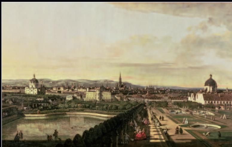
The Belvedere from Gesehen, Vienna by Bernardo Bellotto