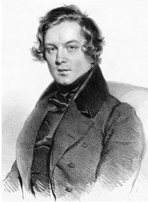
Robert Schumann in 1839 Lithography by Josef Kriehuber (1800–1876)

This is not Sonata Form, the thesis/antithesis/synthesis that drives Classical