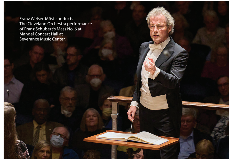
Franz Welser-Möst conducts The Cleveland Orchestra performance of Franz Schubert's Mass No. 6 at Mandel Concert Hall at Severance Music Center.

In 2019, Mr. Welser-Möst was awarded the Gold Medal in the Arts by the Kennedy Center International Committee on the Arts. Other honors include The Cleveland Orchestra's Distinguished Service Award, two Cleveland Arts Prize citations, the Vienna Philharmonic's "Ring of Honor," recognition from the Western Law Center for Disability Rights, honorary membership in the Vienna Singverein, appointment as an Academician of the European Academy of Yuste, and the Kilenyi Medal from the Bruckner Society of America. ■