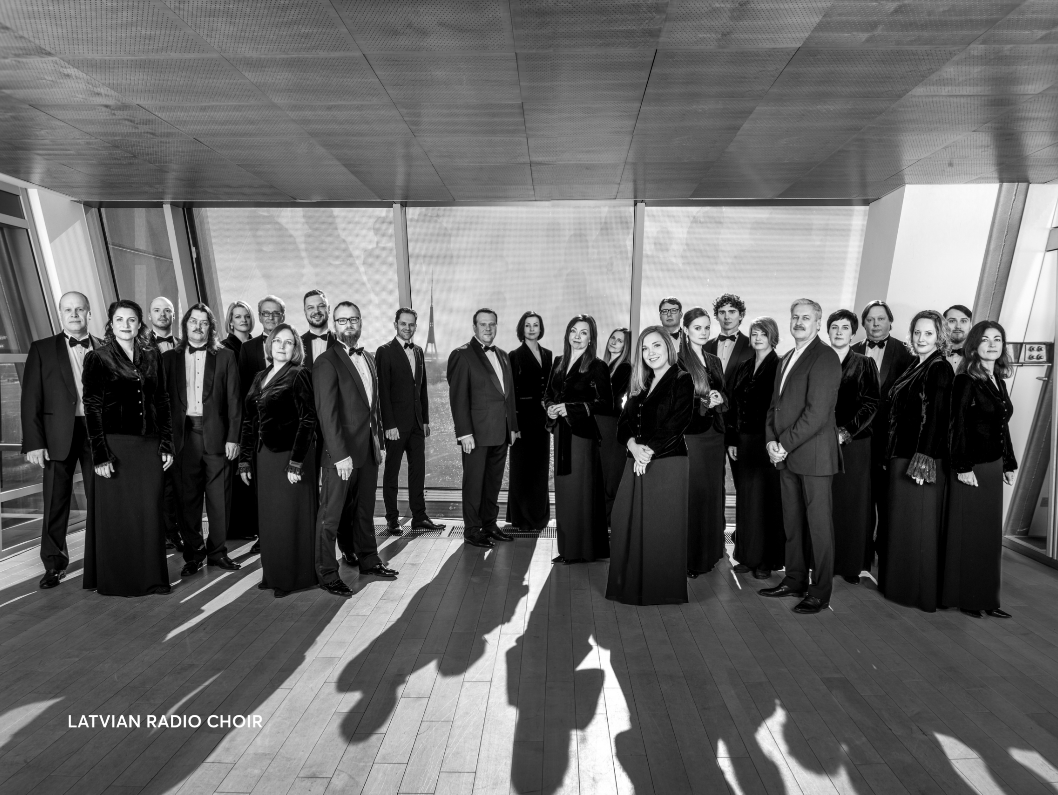
LATVIAN RADIO CHOIR