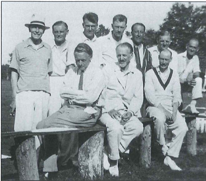
Old Broughtonians Cricket Team, 1932

been made in this recording to restore the manuscript's original phrasing and thus reveal the composer's original intentions.