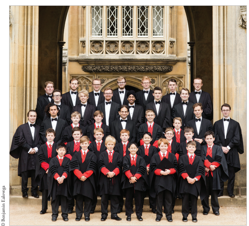
The Choir of St John's College, Cambridge

The Choir would like to thank the following donors for their generous support of this recording