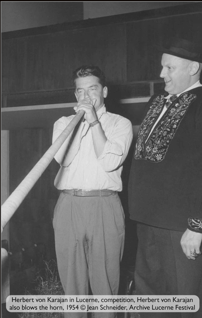
Herbert von Karajan in Lucerne, competition, Herbert von Karajan also blows the horn, 1954