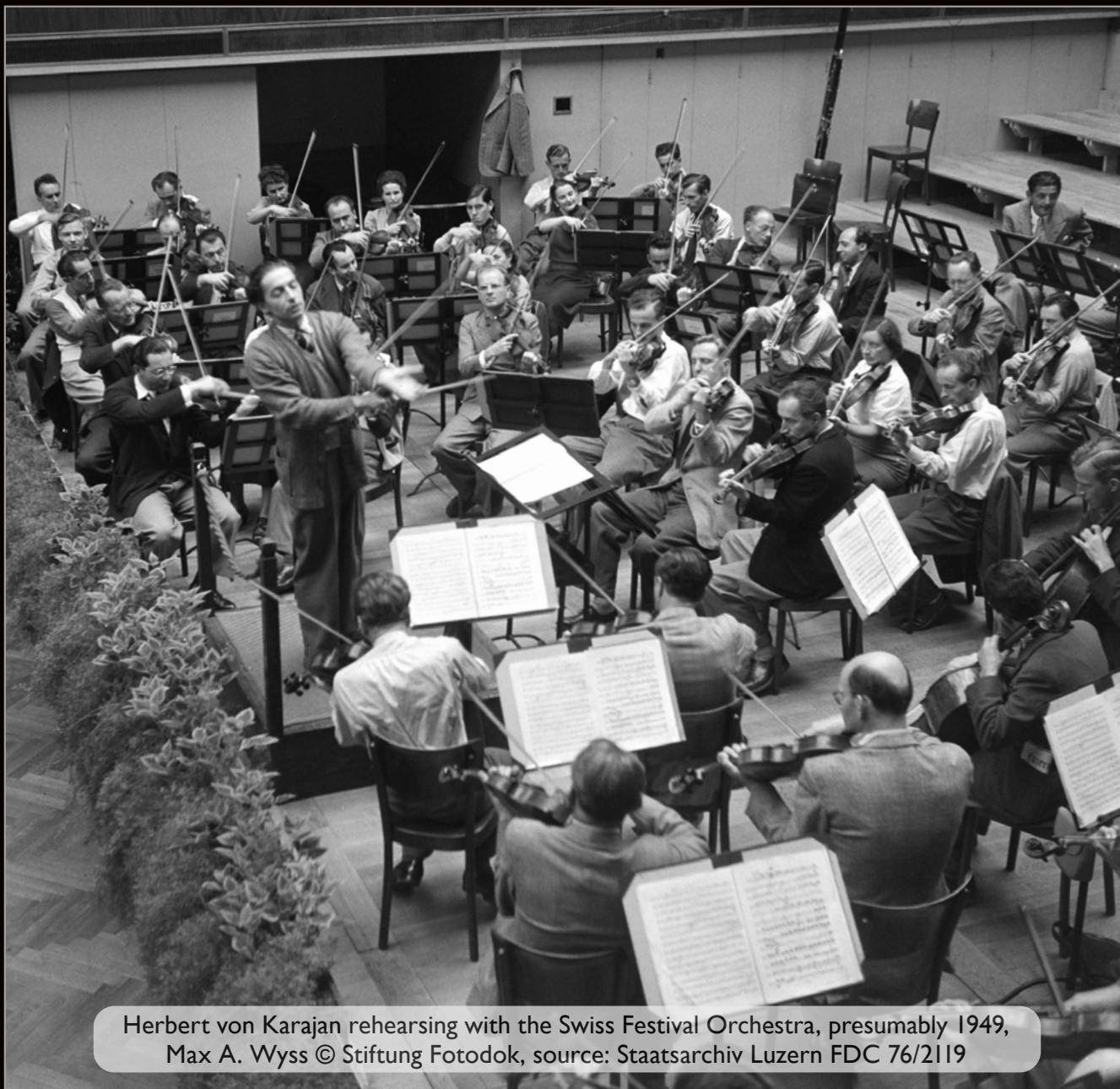
Herbert von Karajan rehearsing with the Swiss Festival Orchestra, presumably 1949, Max A. Wyss © Stiftung Fotodok, source: Staatsarchiv Luzern FDC 76/2119