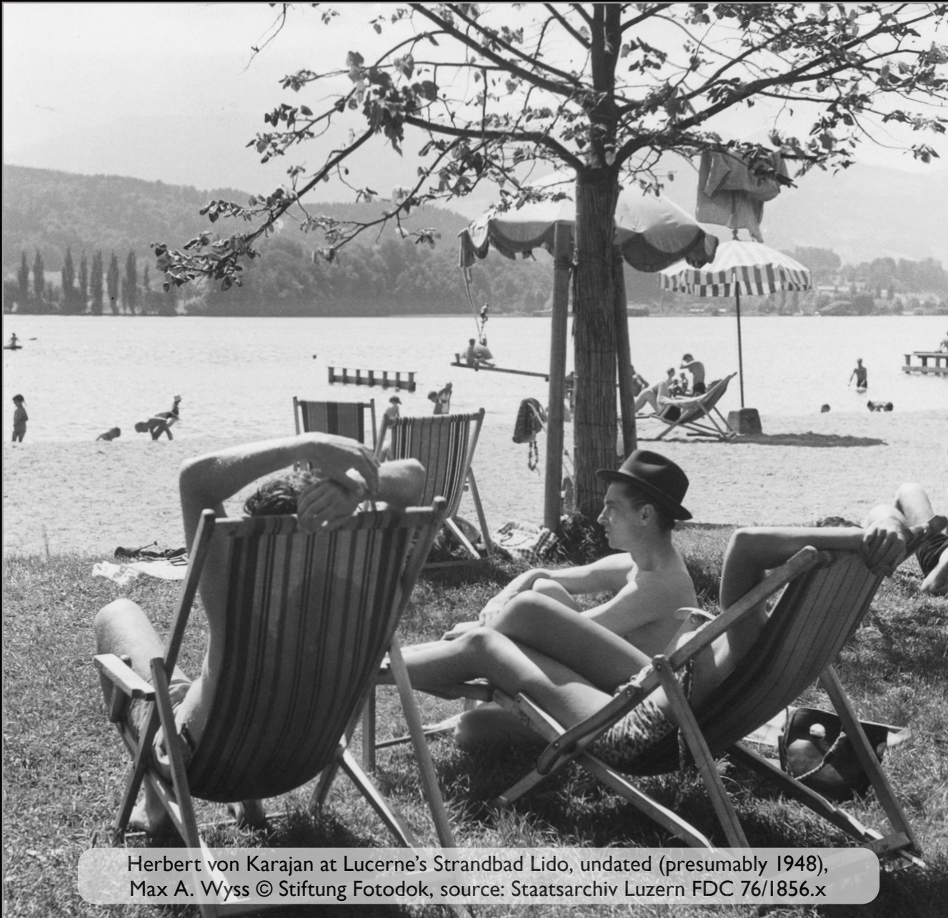
Herbert von Karajan at Lucerne's Strandbad Lido, undated (presumably 1948)