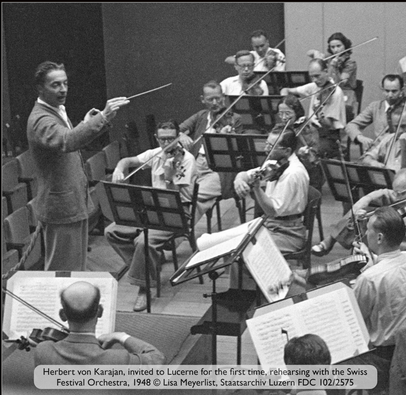
Herbert von Karajan, invited to Lucerne for the first time, rehearsing with the Swiss Festival Orchestra, 1948