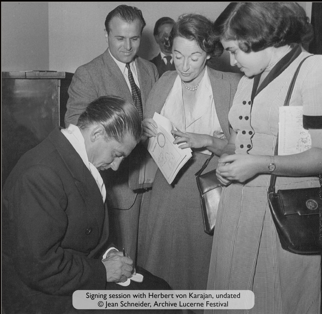
Signing session with Herbert von Karajan, undated