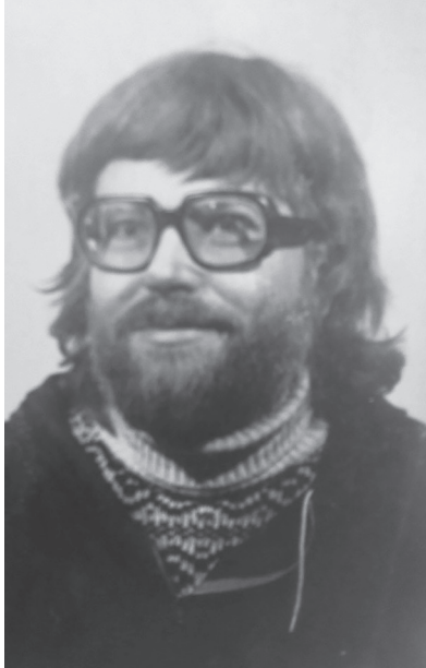
FINN LYKKEBO