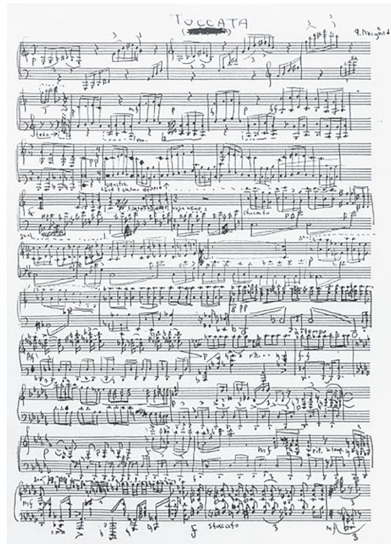
Nørgård's original manuscript for Toccata (1949)