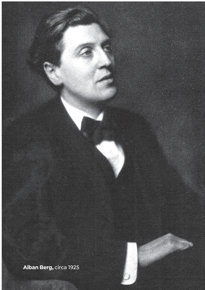
Alban Berg, circa 1925

THE CLEVELAND ORCHESTRA conducted by FRANZ WELSER-MÖST