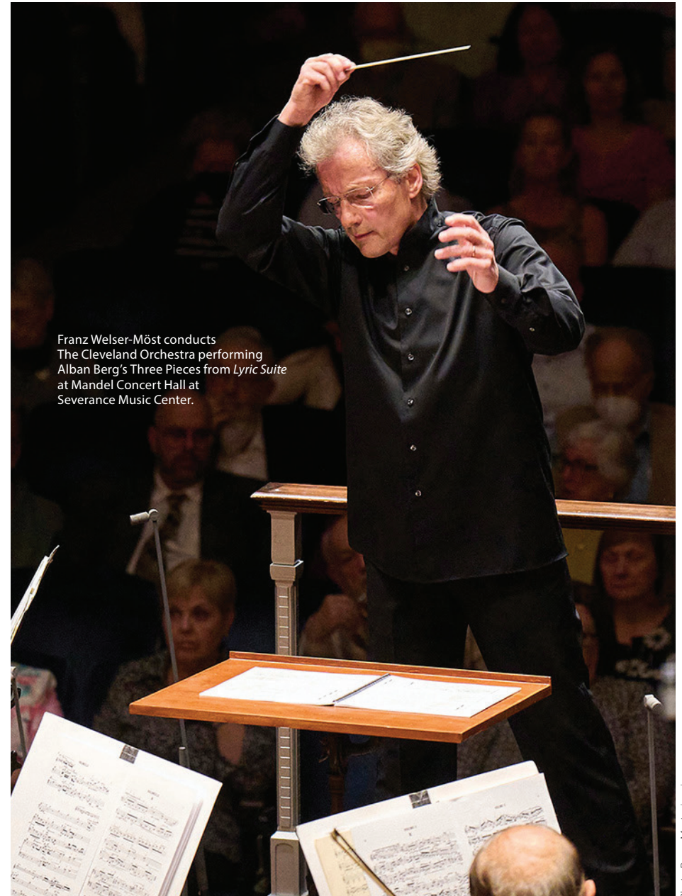
Franz Welser-Möst conducts The Cleveland Orchestra performing Alban Berg's Three Pieces from Lyric Suite at Mandel Concert Hall at Severance Music Center.

In 2019, Mr. Welser-Möst was awarded the Gold Medal in the Arts by the Kennedy Center International Committee on the Arts. Other honors include The Cleveland Orchestra's Distinguished Service Award, two Cleveland Arts Prize citations, the Vienna Philharmonic's "Ring of Honor," recognition from the Western Law Center for Disability Rights, honorary membership in the Vienna Singverein, appointment as an Academician of the European Academy of Yuste, and the Kilenyi Medal from the Bruckner Society of America. ■