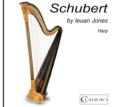
Claudio: CR6032-2 CD & CR6032-6 DVD-Audio

- Traditional Songs for Tenor & Harp -Song texts available from: ClaudioRecords.com - see catalogue page